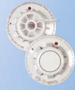
Up to 20 fire/heat detectors per zone