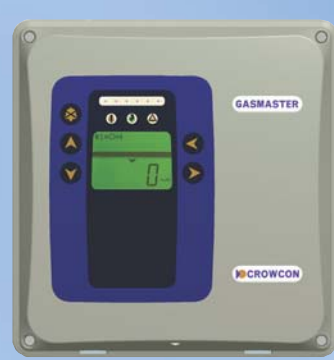
Gasmaster 1 control panel for one gas detector, fire zone or Environmental Sampling Unit.