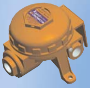
Industry-standard gas detectors