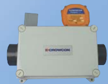
Sampling Device control for Crowcon's Environmental Sampling Unit